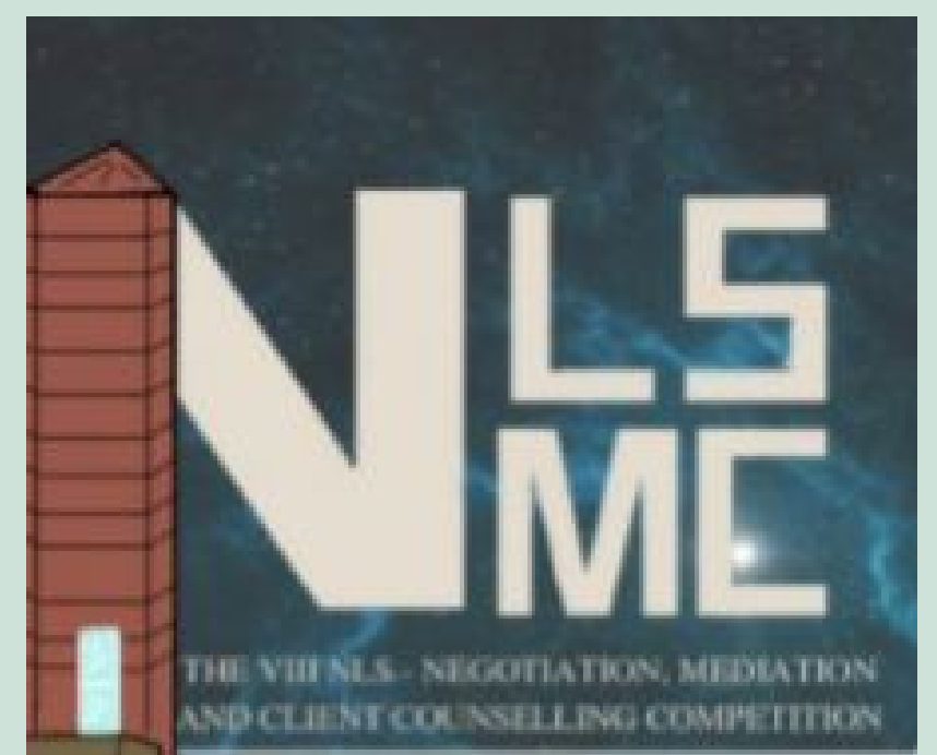
THE VIII NLS - NEGOTIATION, MEDIATION AND CLIENT COUNSELLING COMPETITION

Each team in each segment will have to pay a registration fee of INR 3500 (For Indian Teams) and USD 70 (For non-Indian Teams). Each participating team will be allowed to register one coach for each segment of the competition.